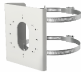
DS-1275ZJ-S-SUS Vertical Pole Mount