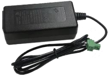
ASW0081-1220002W Power adapter