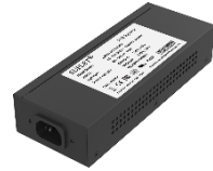
LAS60-57CN-RJ45 Hi-PoE midspan